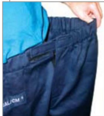
Elastic waistband for maximum comfort.