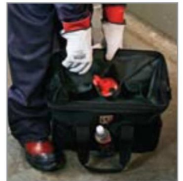
Wide Mouthed Opening

Salisbury, continuing to exceed industry standards.